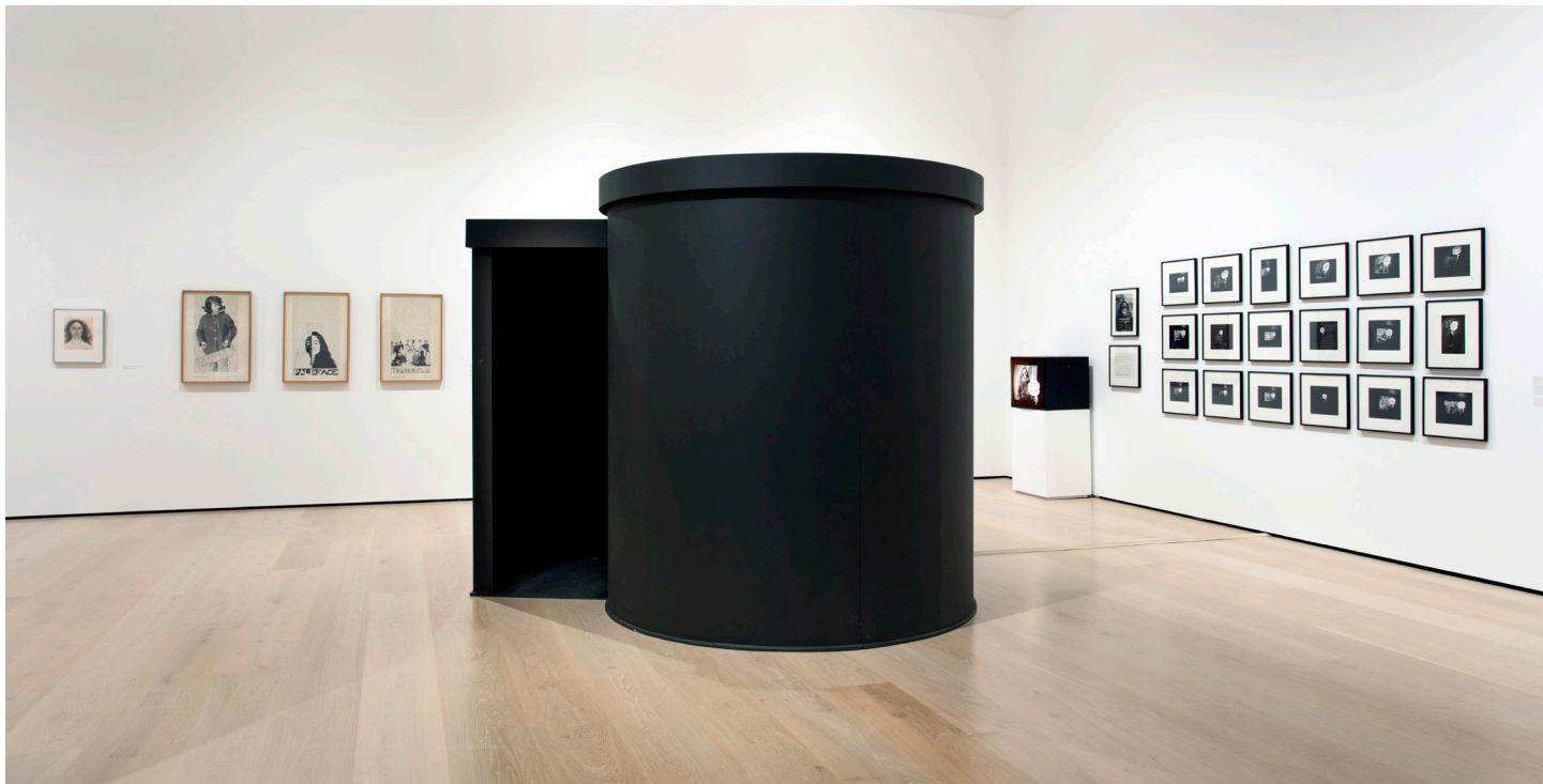
Adrian Piper Four Intruders Plus Alarm Systems , 1980 Mixed-medium installation Constructed wood environment, four photographs, light boxes, audio, and headsets The Ohio State University.

Overhead view Audio transcript: Out of Order, Out of Sight , vol. I: pg. 181-186