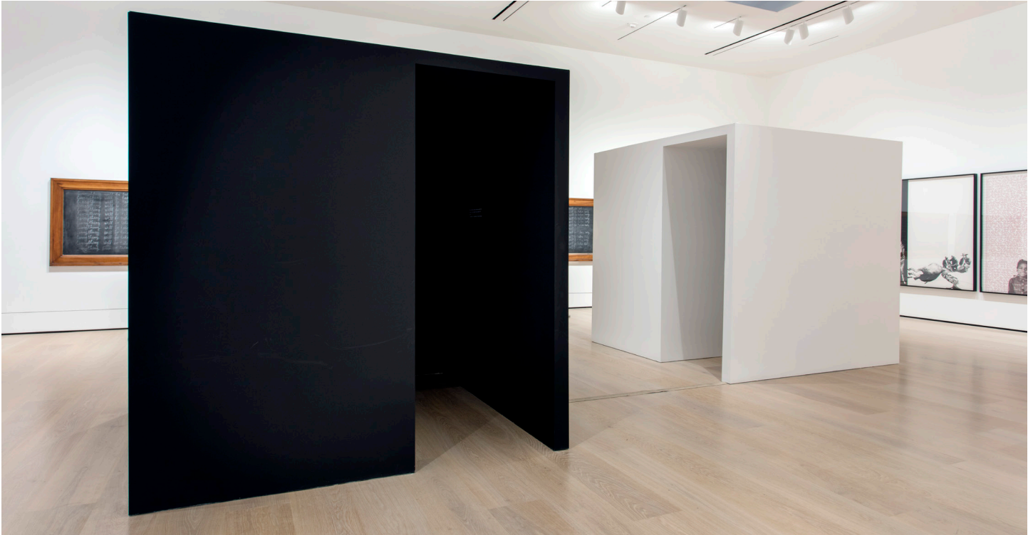
Adrian Piper Black Box/White Box , 1992 Video installation Video (color, sound), 00:30:00, with two constructed wood environments, monitor, four photographs, light box, audio, chairs, tables, tissue boxes, and trash baskets Generali Foundation Collection—Permanent Loan to the Museum der Moderne Salzburg

Audio transcript (left): excerpt from an interview with Rodney King Audio transcript (right): looping sample of Marvin Gaye's 'What's Going On'