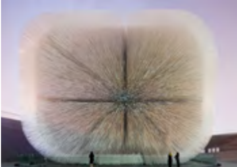
Heatherwick Studio. U.K. Pavilion, Shanghai World Expo, 2007-10.

Provocations: The Architecture and Design of Heatherwick Studio February 20 – May 24, 2015