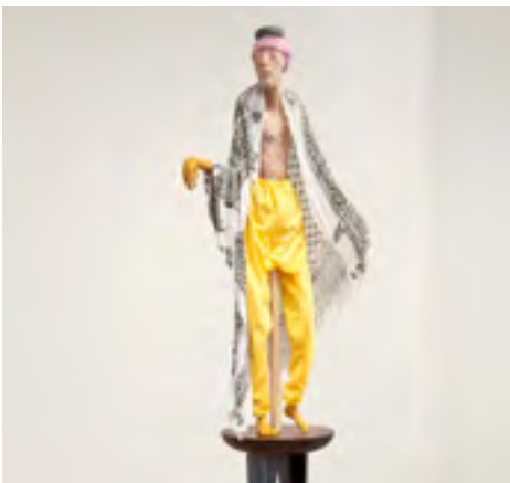
Francis Upritchard. Nincompoop , 2011 (detail). Modeling material, foil, wire, paint and cloth. 39 x 22 7/8 x 9 8/16 in. (99 x 58 x 24 cm). Courtesy of the artist; Anton Kern Gallery, New York; and Kate MacGarry, London.