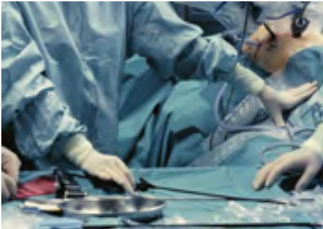
Yuri Ancarani. Da Vinci , 2012 (detail). 35mm film, color 5.1, Dolby Digital audio. 25 min.

Italian artist Yuri Ancarani makes seductive, hypnotic, engrossing films that delve deep into obscure subjects. This is his first solo exhibition in the U.S., and it will feature La malattia del ferro (The disease of iron; 2010–12), a trilogy of short films, each focusing on a highly specialized occupation. The title refers to a syndrome similar to cabin fever, which sailors experienced after being out at sea for great lengths of time. The first film in the series, Il Capo (2010) is a beautiful portrayal of the Carrara marble quarry and the magnanimous foreman directing his crew like an orchestra conductor. Piattaforma Luna (2011) takes us inside the rarely seen daily routine of scuba divers on board a submarine, stationed deep below the surface of the ocean. Da Vinci (2012), features a surgical robot whose mechanical arms perform an operation (guided by a surgeon working remotely), and exquisitely captures the procedure from the inside and out. Together, the three films explore the interdependent relationship between man and machine and the beautiful choreography of labor. Hammer Projects: Yuri Ancarani is organized by Hammer curator Ali Subotnick with Emily Gonzalez, curatorial associate.