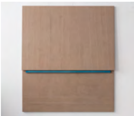
N. Dash. Untitled, 2013. Adobe, jute, wood support, acrylic, graphite, linen. 75 x 96 in. (190.5 x 243.8 cm).

N. Dash September 13, 2014 – January 25, 2015