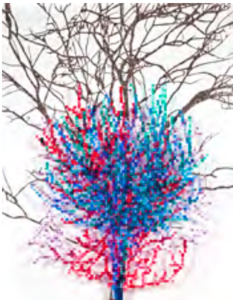
Charles Gaines. Numbers and Trees, Matilda, #4 , 1986. Acrylic sheet, acrylic paint, watercolor, silkscreen, photograph. 59 x 49 x 5 3/4 in. (149.9 x 124.5 x 14.6 cm). Courtesy of Fresno Art Museum, Fresno, California

Highly regarded as both a leading practitioner of conceptualism and an influential educator at the California Institute of the Arts, Los Angeles-based Charles Gaines is celebrated for his photographs, drawings, and works on paper that investigate how rules-based procedures construct order and meaning. Working serially in progressive and densely layered bodies of works, Gaines explores the interplay between objectivity and interpretation, the systematic and the poetic. His groundbreaking work of this period serves as a critical bridge between the first generation conceptualists of the 1960s and 1970s and those artists of later generations exploring the limits of subjectivity and language. Charles Gaines: Gridwork 1974–1989 is the first museum survey of the early work of a career that now spans four decades and includes rare and never-before-seen works, some of which were presumed lost.