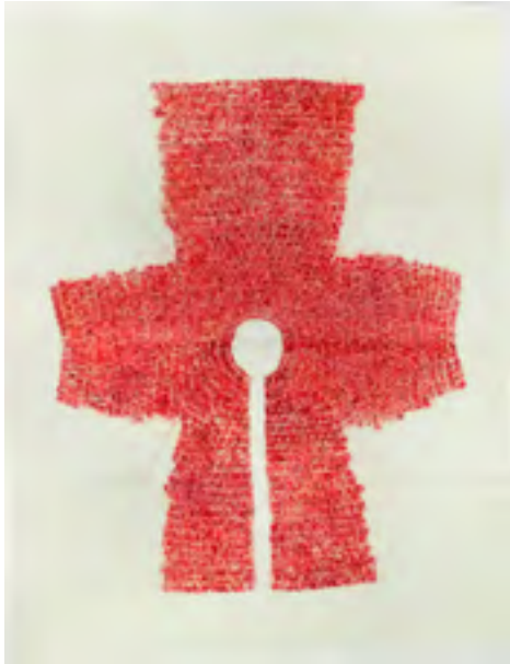
Do Ho Suh. Rubbing/Loving project: Metal Jacket , 2014. Colored pencil on mulberry paper. 85.5 x 69 in. (217.2 x 175.3 cm). © Do Ho Suh. Courtesy the artist and Lehmann Maupin, New York and Hong Kong.

Apparitions: Frottages and Rubbings from 1860 to Now is the first museum exhibition to explore both the historical roots and contemporary impact of the automatic drawing method developed by Max Ernst (German, 1891–1976). Curated by Allegra Pesenti, Chief Curator of the Menil Drawing Institute, and featuring a fully illustrated catalog, the exhibition will include approximately one hundred works on paper by fifty artists.