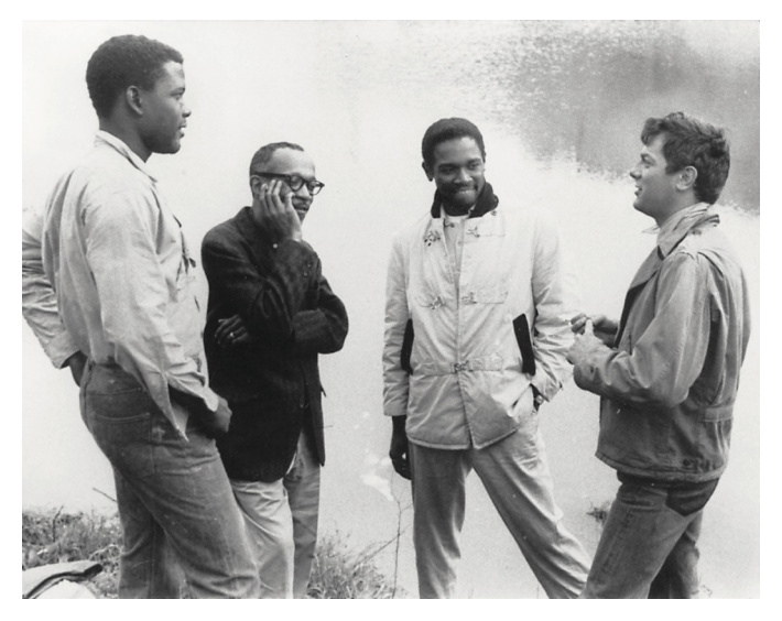
On the set of the film The Defiant Ones , 1958. From left: Sidney Poitier, Charles White, Ivan Dixon, and Tony Curtis.

Most accounts of this group focus on how these artists tried to develop film styles that challenged the condescending and disingenuous treatment of black people in film, not just on the screen but behind the camera.<sup>2</sup> For example, many of them found the "Blaxploitation" fare that was being distributed to black neighborhood theaters to be as problematic as the classic Hollywood movies they had watched growing up. Both types of films were made and circulated primarily by whites, leaving black people with extremely limited control over the making and exhibition of their own media images. Thus, the attempts by many of these filmmakers to resist the co-opting of black creativity by the dominant film industry and to develop a distinct black film aesthetic constituted a complex balancing act. How could they address the socioeconomic plight of black people still struggling for rights and recognition (including L.A.'s disenfranchised black populations) and at the same time develop their own personal artistic visions and chart individual career trajectories, all in the long shadow cast by Hollywood?